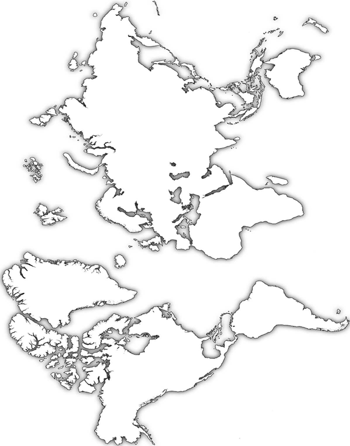
Map #1: World Regions